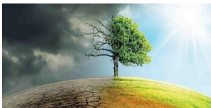
Newman Association Talk

Climate Change and what responses are offered by both Faith and Science Thursday, 17 November 7.30pm in St George's Parish Hall